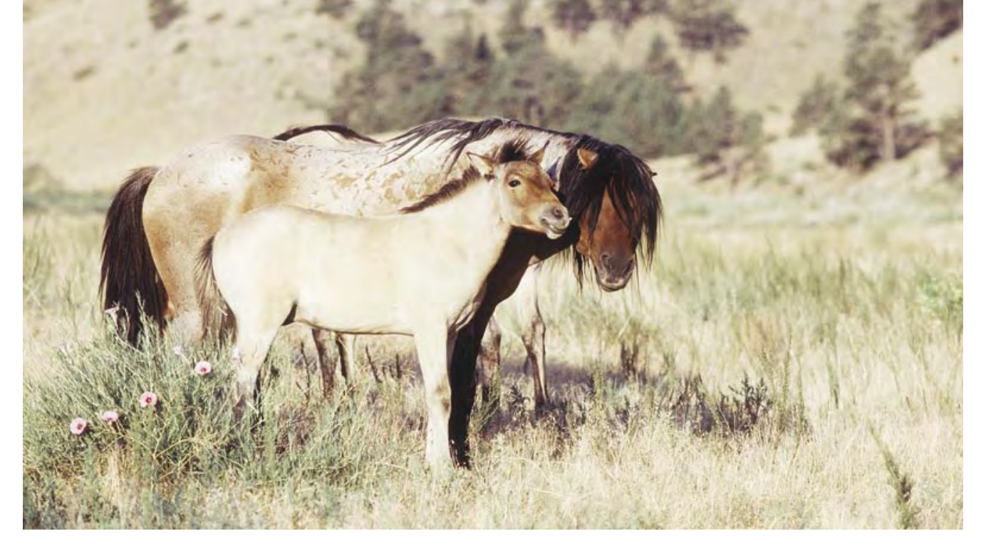
Most of the foals born on the Black Hills Sanctuary are sold as pets to raise money to support the wild herds and prevent overgrazing.

Sanctuary founder Dayton Hyde brought 300 mustangs to this land in 1988. An Oregon rancher, naturalist, and author, Hyde was driving through Nevada the previous year and heard the screams of wild horses crowded into BLM pens. A federal law had been passed in 1971 to protect wild horses from slaughter, but its unintended result was that the wild horse population grew large enough to alarm other constituencies—cattle ranchers who wanted to graze their animals on public lands, suburbanites who found wild hors-